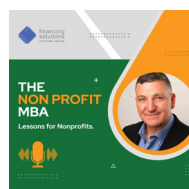
The Nonprofit MBA