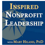
Inspired Nonprofit Leadership