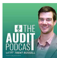
The Audit Podcast