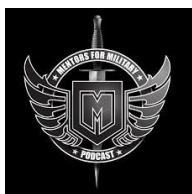
Mentors for Military

Greenleaf researched and identified niche podcasts relevant to Jason's content with a range of 1,000 to 100,000 followers. Jason's digital media strategist crafted a customized pitch for each of these podcasts and conducted outreach and follow-up as necessary to secure interviews. Once a host requested an interview, Greenleaf assisted in scheduling and provided Jason with guidance on how to successfully promote the shows for additional exposure as they went live. Jason was featured on a variety of notable podcasts in multiple genres, including: