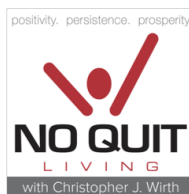
No Quit Living