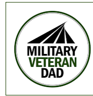
Military Veteran Dads