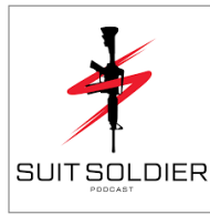
The Suit Soldier