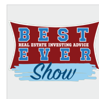
The Best Ever Show