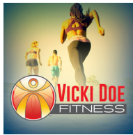
It's All About Health & Fitness