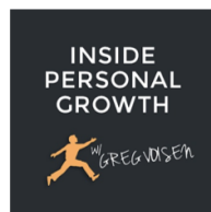
Inside Personal Growth